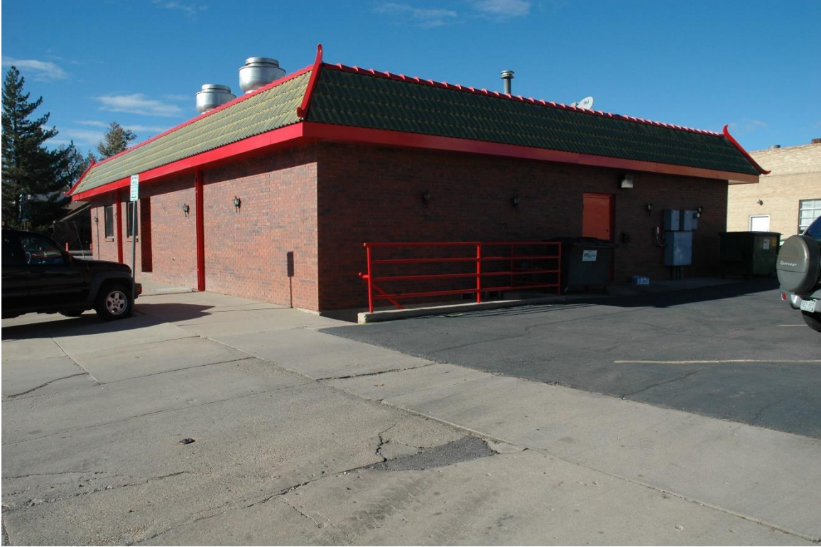
CD 2, Image 13, View to NW of south side and rear (east)