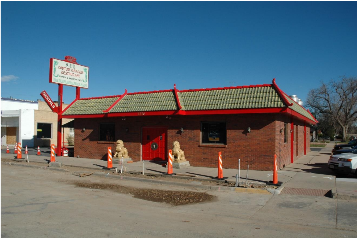
CD 2, Image 12, View to ENE of façade (west)