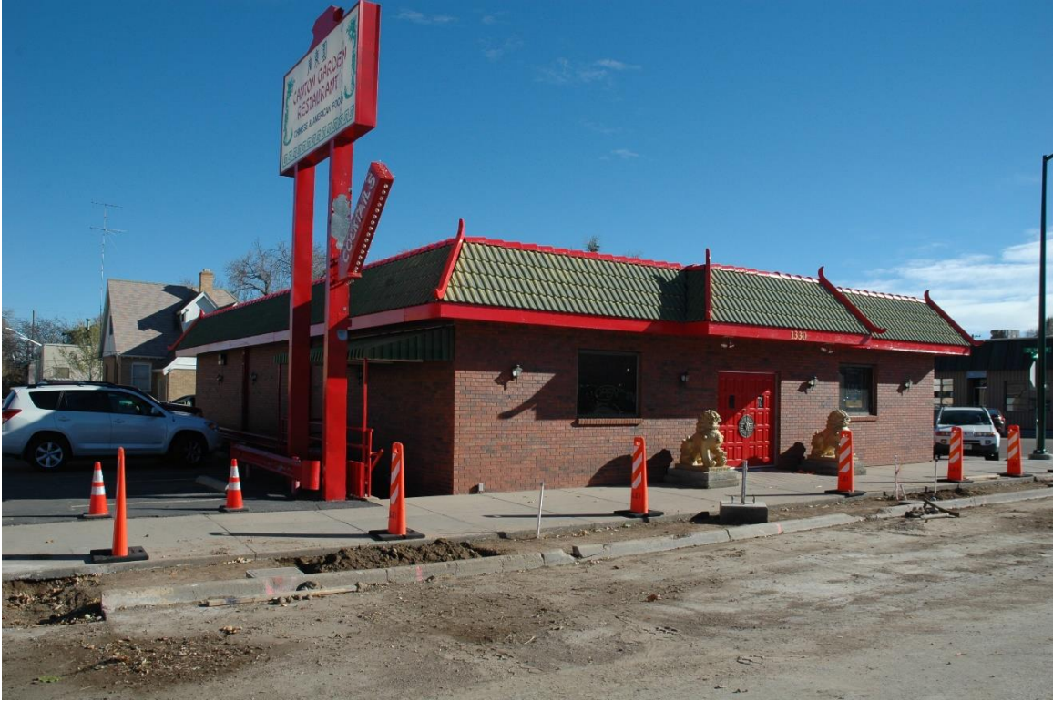
CD 2, Image 11, View to SE of façade (west) and north side