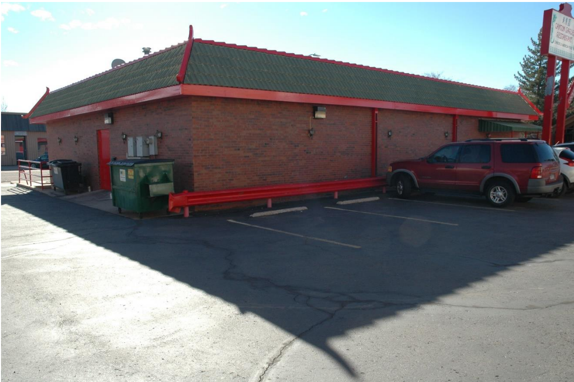
CD 2, Image 14, View to SW of rear (east) and north side